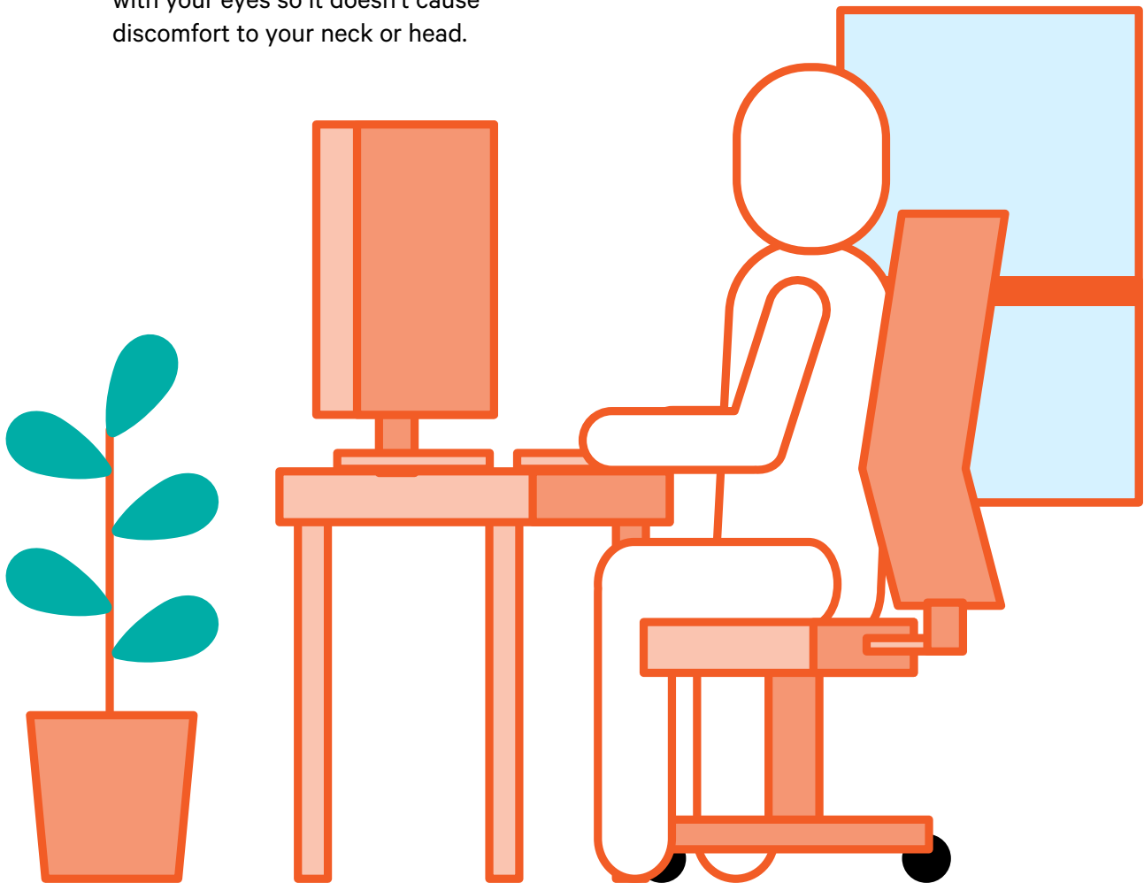
Table setup: Make sure your desk or table has enough surface space to work comfortably.

Get moving: Aim to get up and move around or stretch once an hour – you could set a timer on your phone as a reminder.